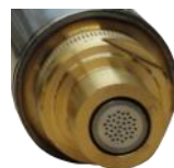
Optional with steam core vent