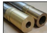
More sizes of plungers